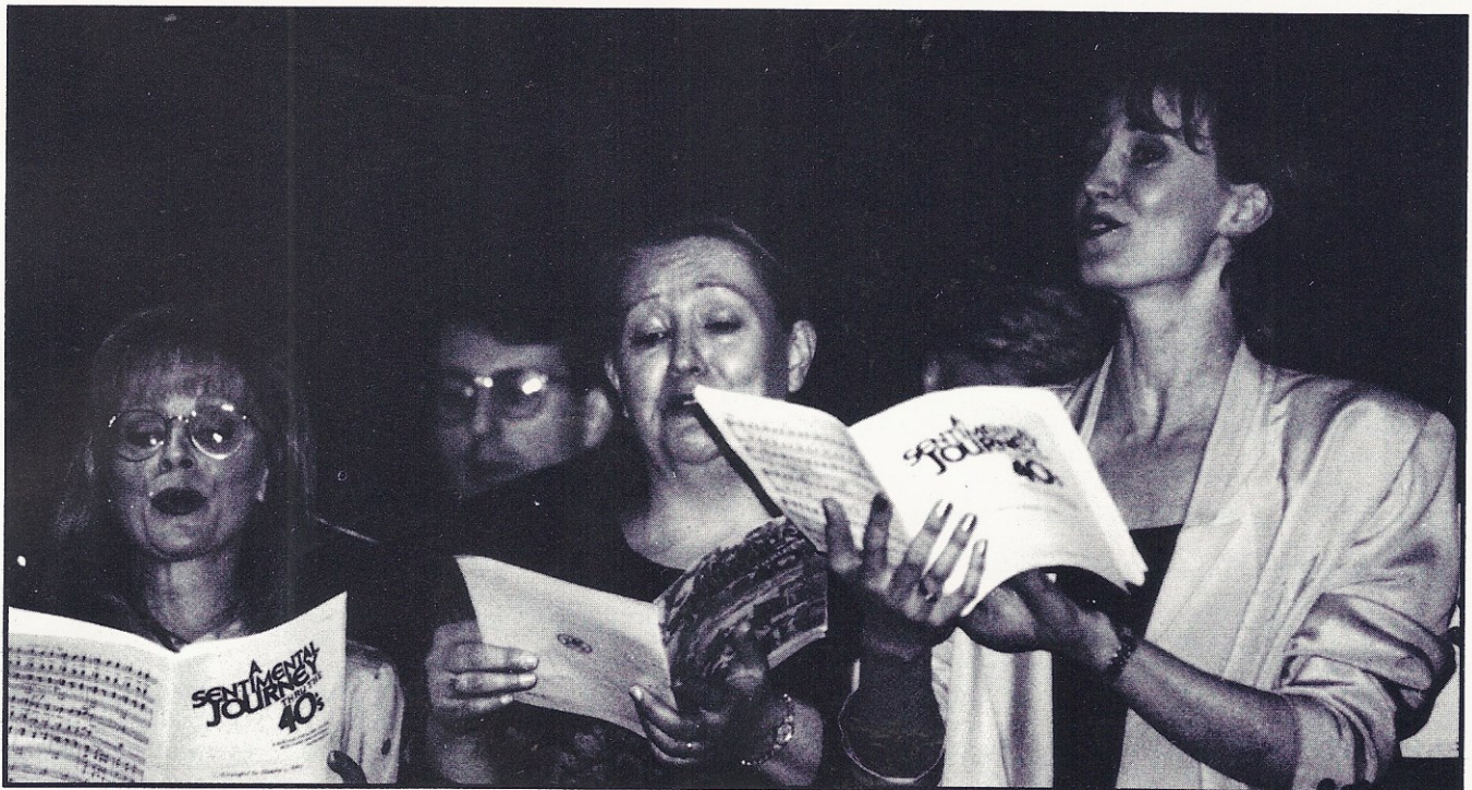
Unionaire members take "A Sentimental Journey into the Forties" at the Friday afternoon luncheon